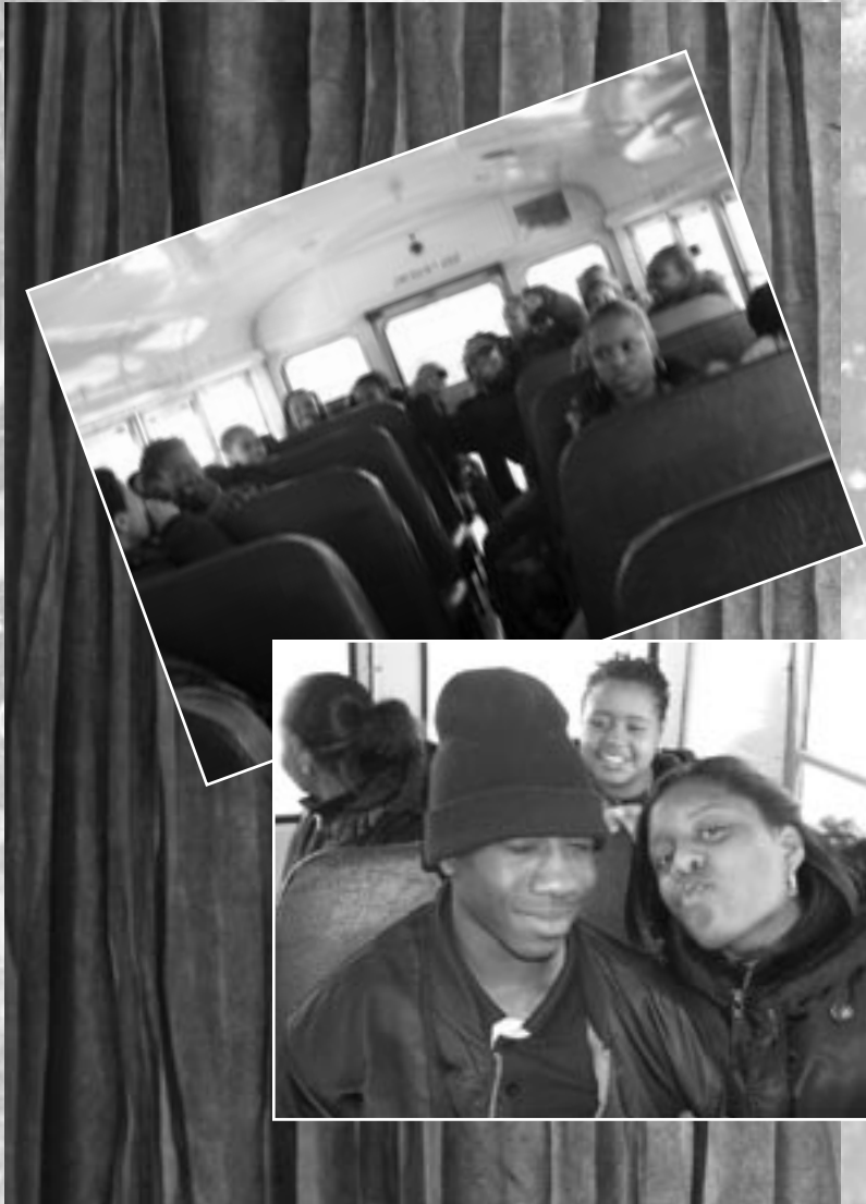
top: kids on the bus